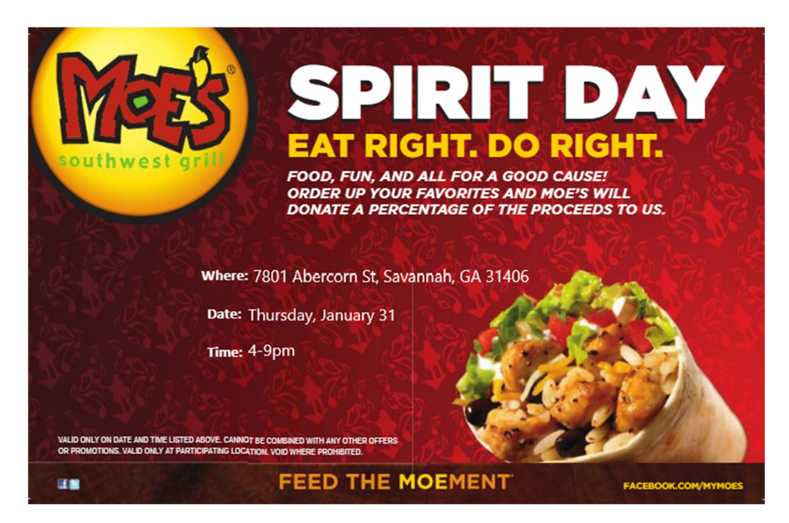
Eat at the Moe's on Chatham Plaza, across from the Oglethorpe Mall, on January 31 from 4-9pm (but before flute choir rehearsal!) and mention the Savannah Area Flute Association at checkout and 20% of proceeds will go to support the SAFA!