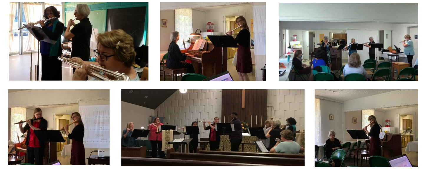
Flute Day 2018